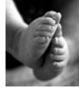
Year of Birth