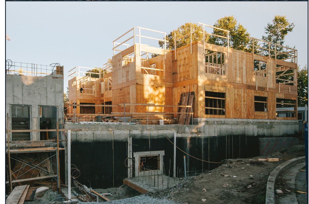
Vancouver Community Land Trust Foundation Construction Site