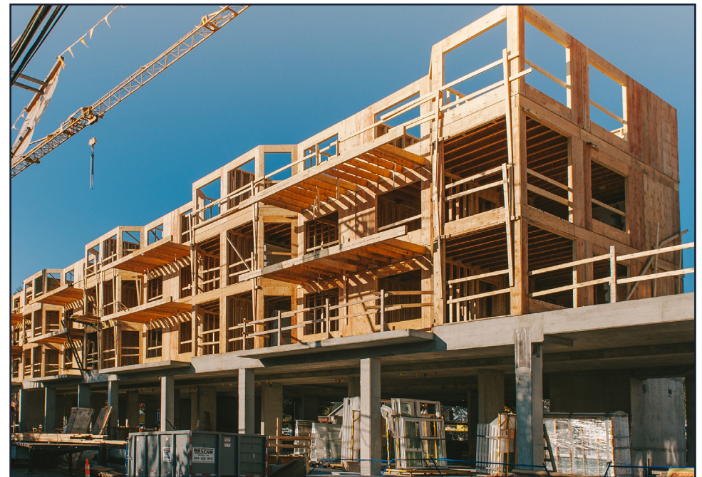
Vancouver Community Land Trust Foundation Construction Site